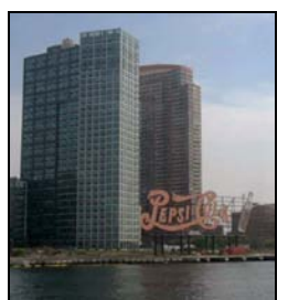
The Mixed-Use Commercial and Residential Waterfront