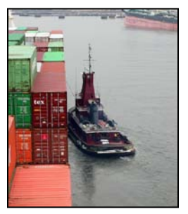
The Working Waterfront