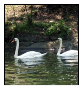
The Natural Waterfront